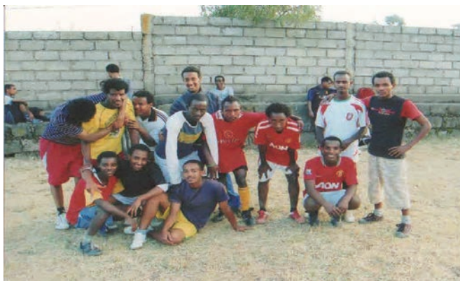
Students Sport Team

Towards the end of the quarter, HUC participated in the Annual Sports Festivals organized by Association of Private Higher Education Institutions. Our students competed in events that included Volley Ball, Badminton, and athletics. Being first timers to the occasion, our students could not bring trophies but their enthusiasm both during opening ceremony and the competitions was extraordinary indeed. We are quite proud of them.