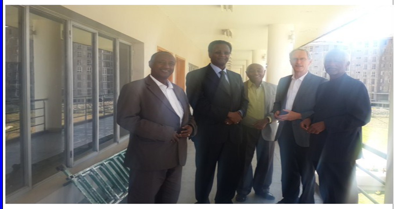
Some of the Advisory Committee members during campus tour

The first Advisory Committee meeting was held during the last days of December 2015. The committee is comprised 8 members from our two major stakeholders and representatives from Hope Enterprises Board were present. As this was their introductory session, familiarization with Hope Enterprises systems, particularly with the College's functional units, the members were briefed by both the Executive Director of the Enterprises and the President of the College on the present and up-coming five year (2015-2016) strategic plan.