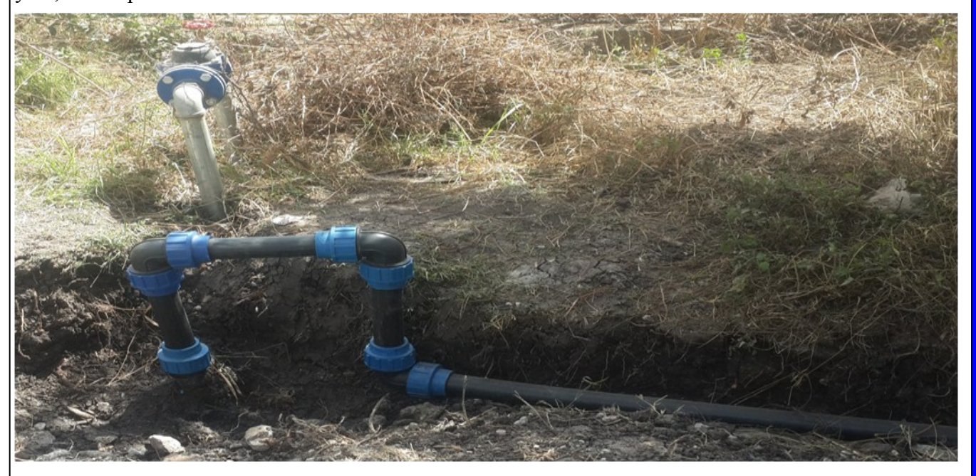
The new water supply line extension

An alternative to the underground water, a new and sustainable water supply from the city's main water supply system was completed earlier. This will ensure the water availability on campus through out the year, it is hoped.