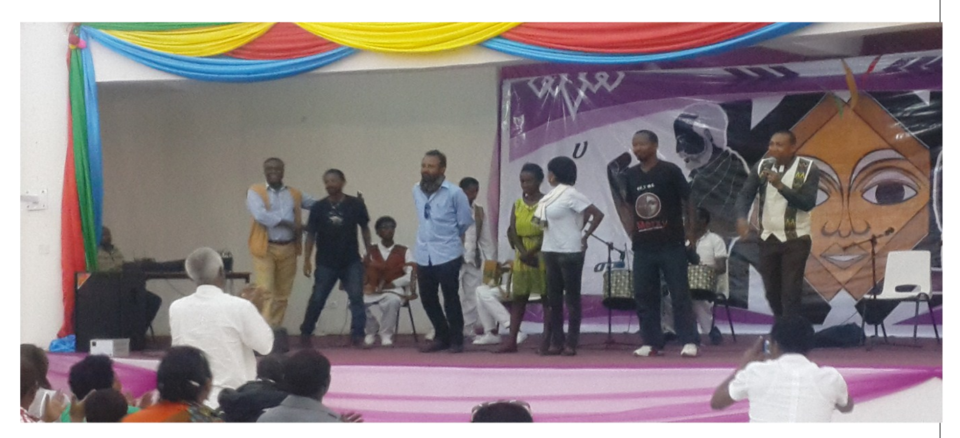
educational entertainment programs

In its outreach and community program, the College has also started in reaching out the surrounding community by arranging educational entertainment programs in collaboration with both amateur and well-known local artists.