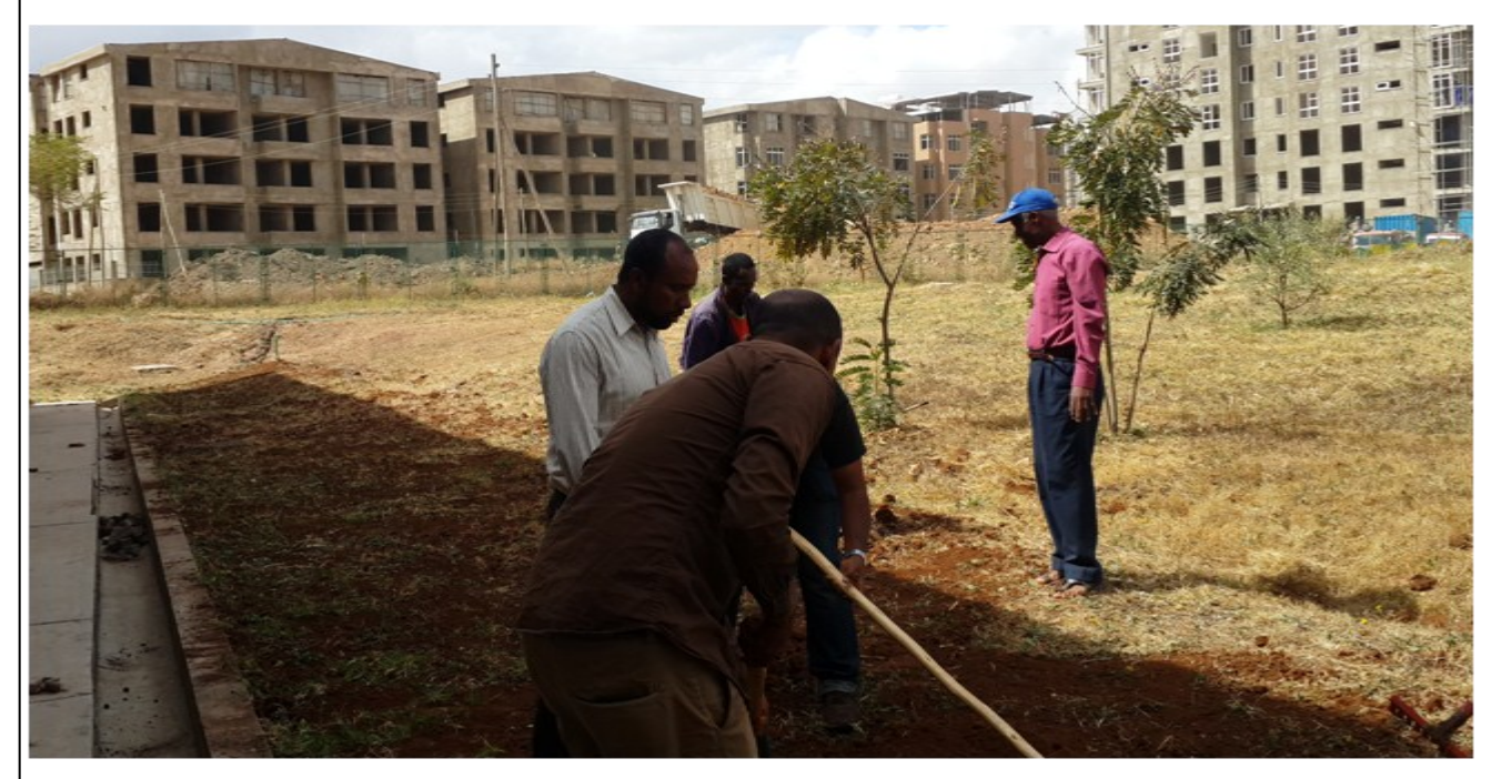
Soils are also treated!

A well-organized road map has been developed to scale up the campus beautification project by taking it to the next level. As a result, red top soil has been applied to the lawns in order to improve the soil texture and soon, further greening and beautification plans will be implemented.