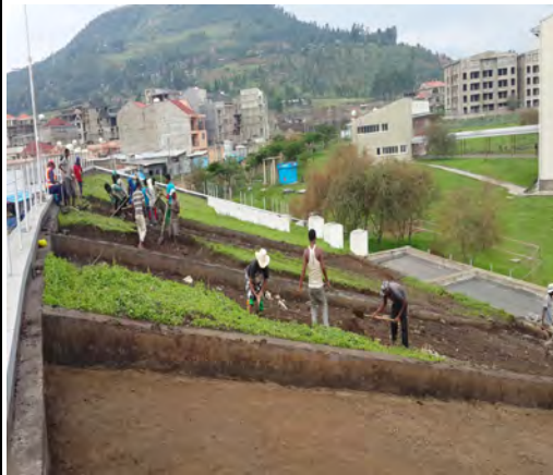
Library roof repair underway

Our ICT unit service has major service breakdown because part from Oracle Server was blown out. Technicians identified the part and a process now has started to import the part from out side. In the meantime, the server was reconfigured to resume the interrupted internet service, on limited scale though.