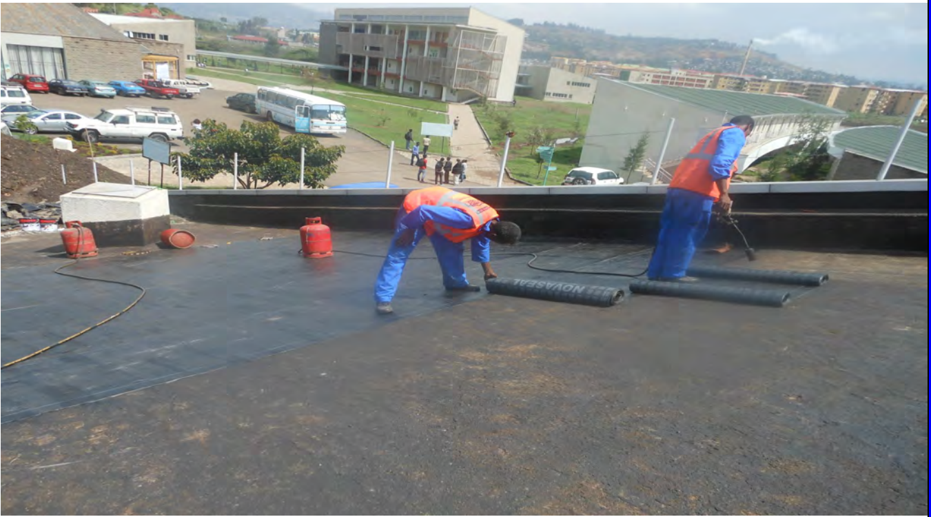
Library roof waterproofing advances