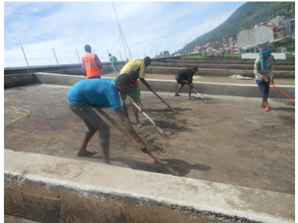
Library roof repair progresses further