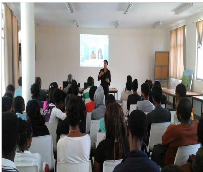
Awareness on an environmental issues

Students participated in various activities in the College. Earth and Environmental days were celebrated on campus with colorful art displays on April 22 and June 12, respectively. On the Earth day, presentations by ESSD students and professionals took place including sustainable art show. Students from environmental science presented on the issues of endemic animals in Ethiopia. They also discussed the need to address ecological balance that accommodates the natural environment. In the afternoon, a discussion was held with board members of Hope and the management of the college in how to improve the upkeep on the campus with environmentally friendly approach. Students participated actively in the discussions, renewing their commitment to change the way we care for the campus and then influence the neighborhoods as well. The board members also promised to work cooperatively with the College community.