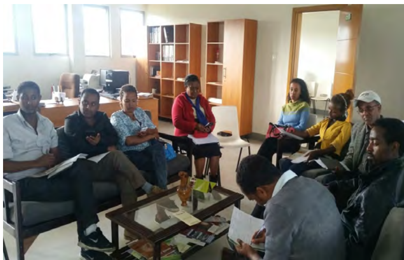
Discussion about Alumni Association Formation

Formation of Hope Alumni Association was in the planning since the day of graduation last July, 2014. Since now all our first batch has joined the work force, the members have started the long process of association formation. Through the follow-up support of the Dean of student affairs office, the members have made series of meeting and formed association organizing committee. This committee is working on the modus-operandi of the association. The Hope Enterprises legal department is assisting in the legal frame work of the association formation.