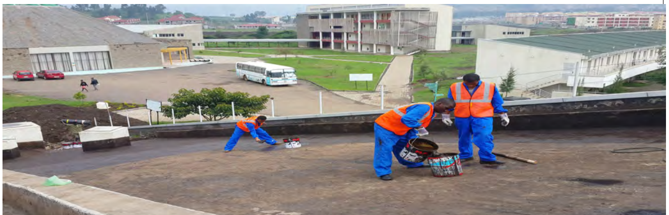
Preparing for waterproofing