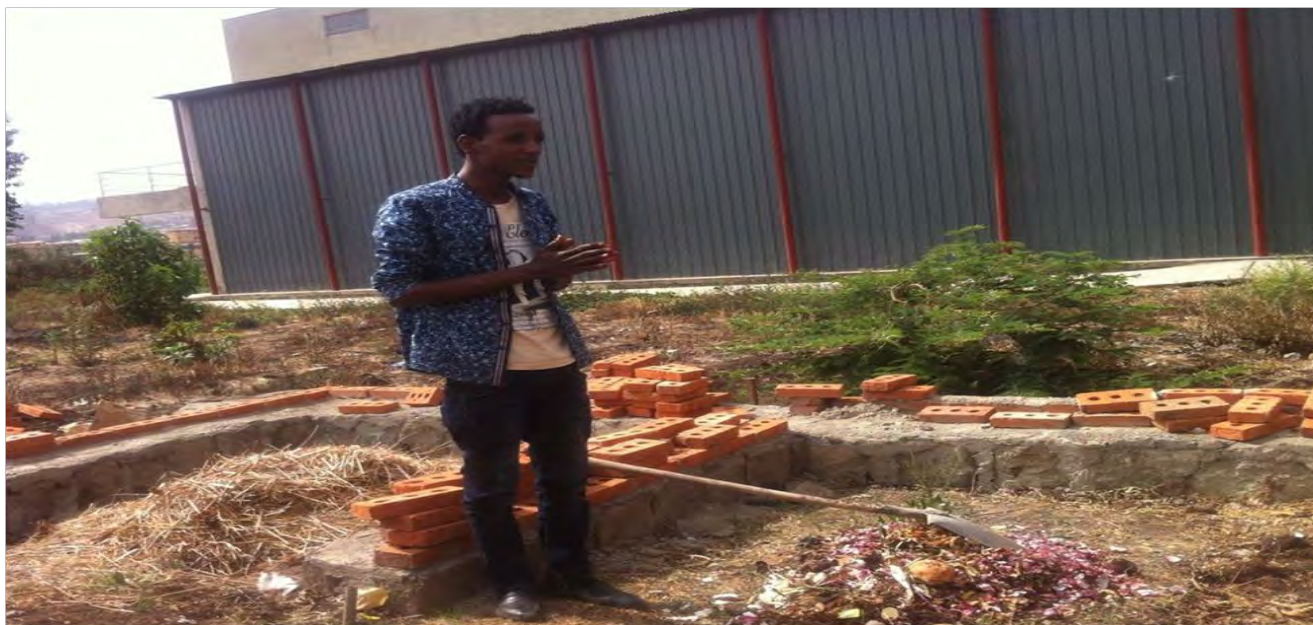
Presentation on compost making by ESSD student

The discussion was followed with out door activities where tree planting was carried out in the campus while students presented their work in preparing compost and developing a park by IT students. Visiting was made to a plot designated to plant vegetables. Similar activities were carried out on the world environment day where presentations by professionals on the topic “the youth and the environment” took place. Students again presented their work on waste management. In addition to this, students had many out of campus activities like attending conferences, visiting the herbarium, densely populated quarters of Addis, the botanical garden, soil laboratory and others.