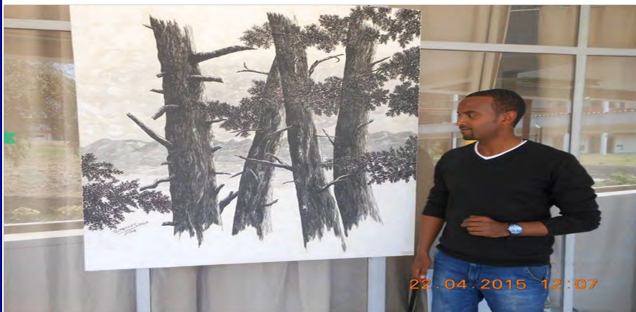
Art display on Earth Day