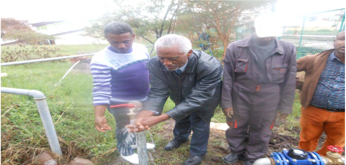
The new water supply being tested

A long served water pump went dead and the campus was absolutely without water for over a week. The good technicians worked day and night and replaced the dead pump with a new one to our delights. In order to insure the sustainability of water supply to the College, direct water supply line from the city water system with a two inch water pipe is now ready for use. As a matter of coincidence, the power line connection to our transformer is now also connected and as a result, the campus power interruption has eased. It is to note that the power connection process took rather long follow-up.