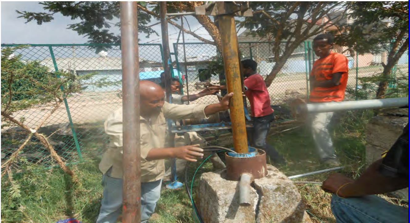
Dead water pump replacement