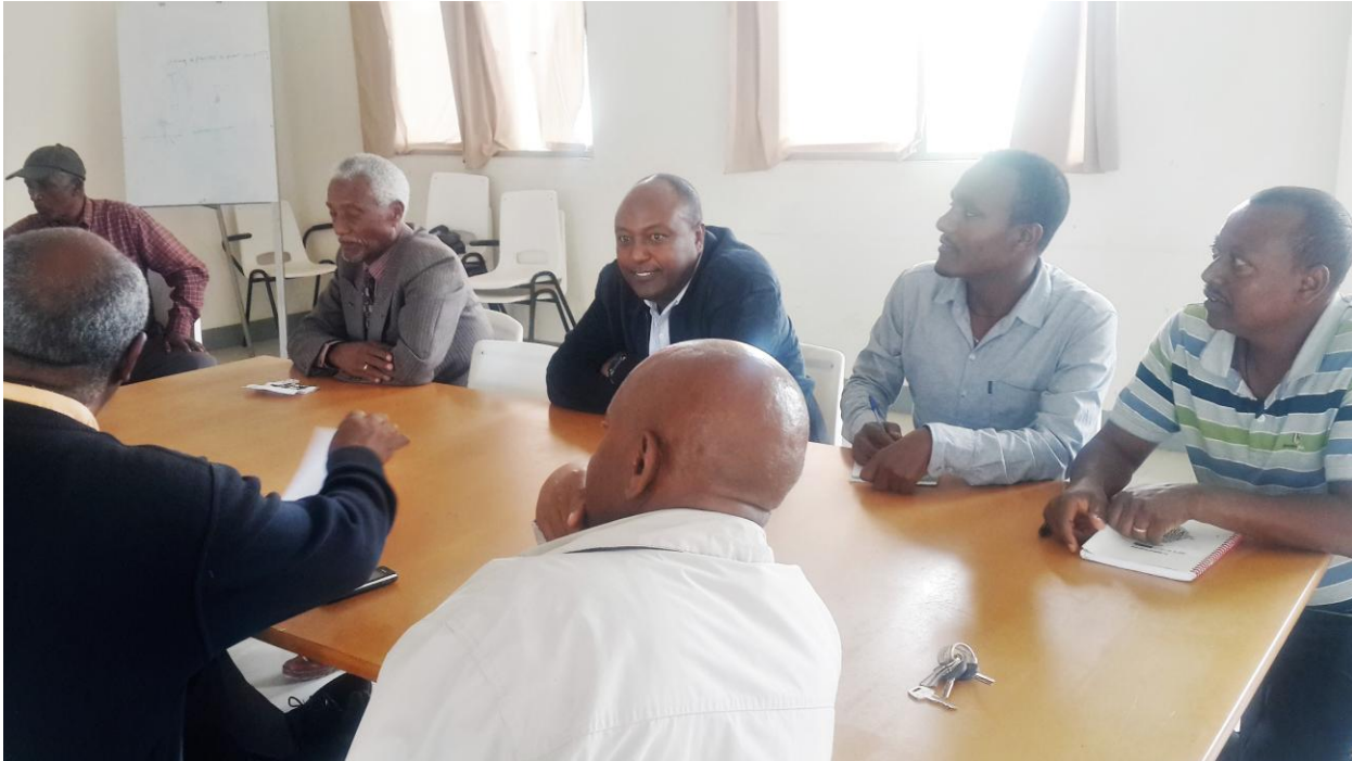
Seminar Presentation Session