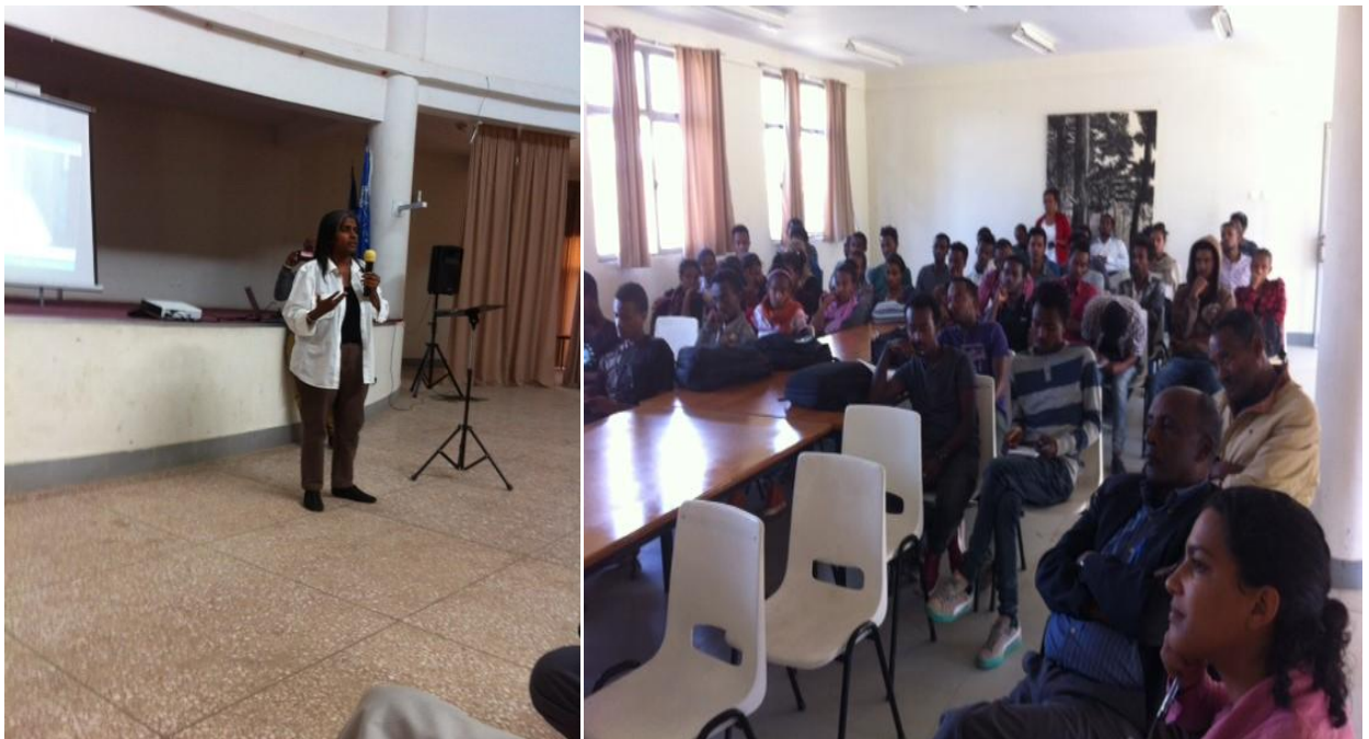
Reflection hour presentation

As part of promoting understanding and good cultural behaviors within our fellow students, a presentation by an invited guest was made on the topic of “Protecting self from bad sexual behaviors. A witness from real life experience presented this topic in a very revealing way. The speaker (an Ethiopian) shared her experience while she was in the USA and Europe and warned the risk of engaging in deviant sexual activities (behavior) and drugs. The speech, during one of the reflection times, was well attended as it addressed the real issues facing our young in the current context.