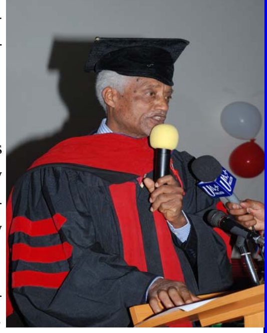
The president addressing the gradu-

ladder to self empowerment, a ladder to self assertiveness in a society. Indeed education puts one on societal map. It makes one recognizable.