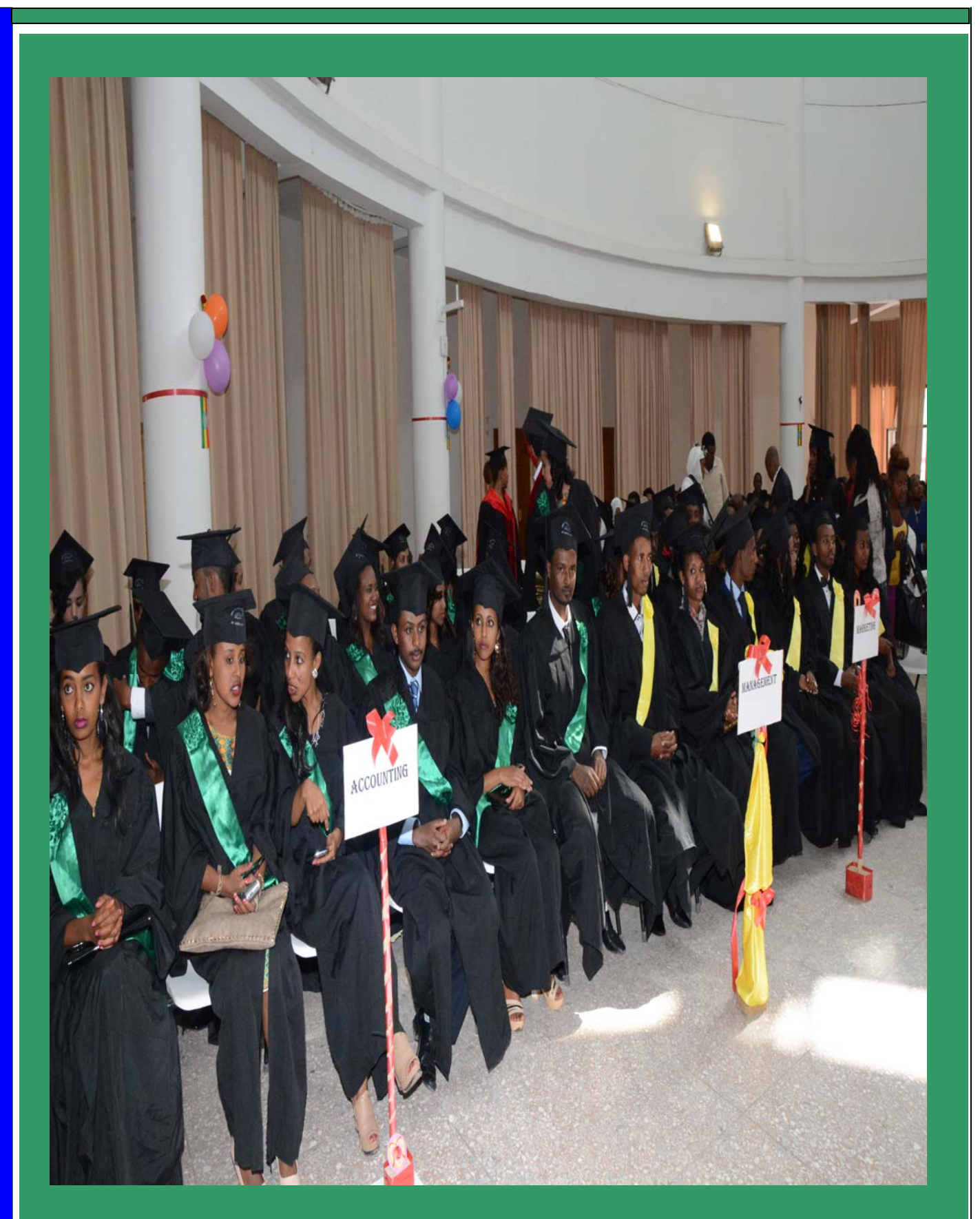
Partial View of Business Faculty Graduates