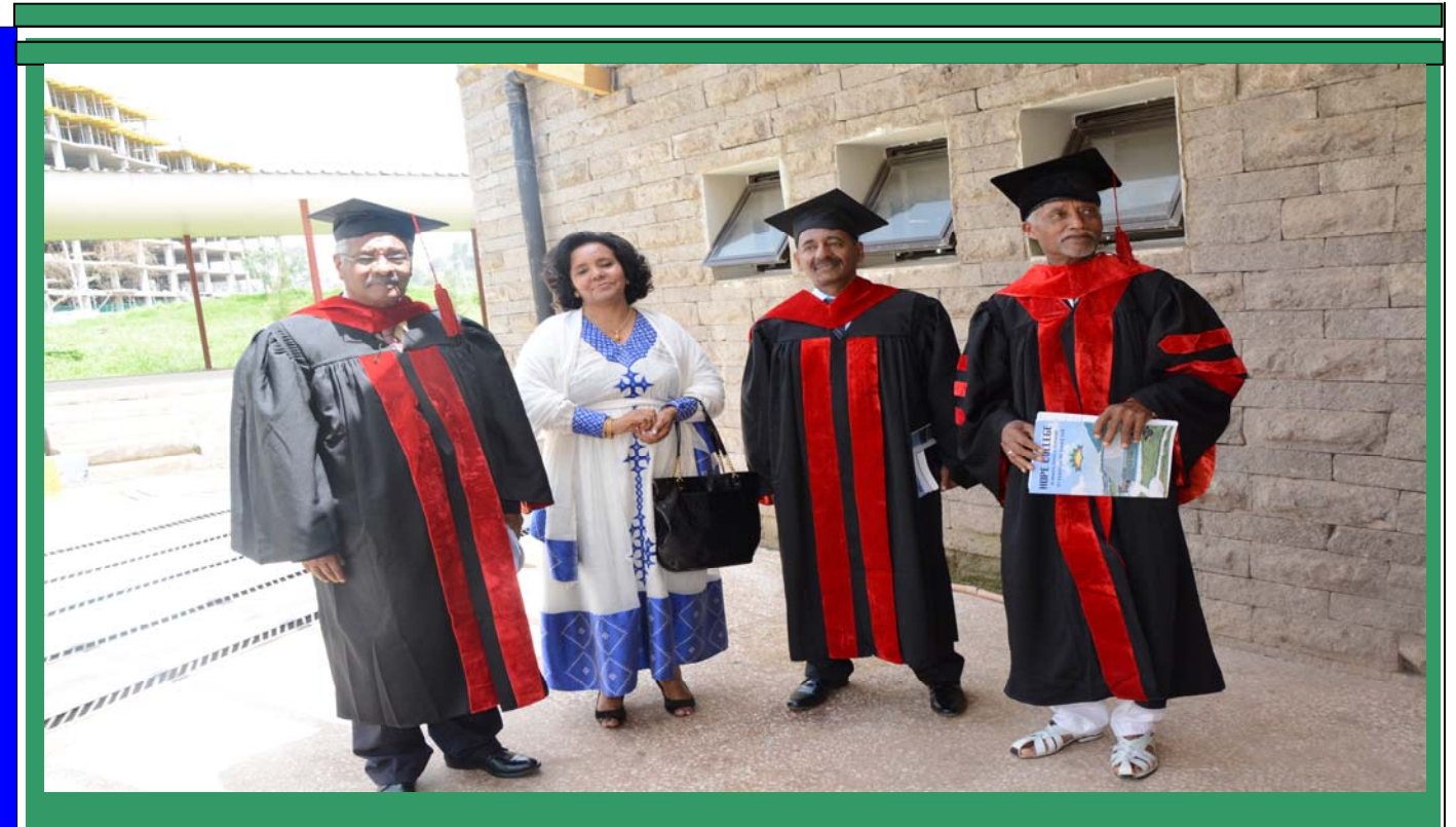
The Guest of Honor with Board & General Assembly Chairmen