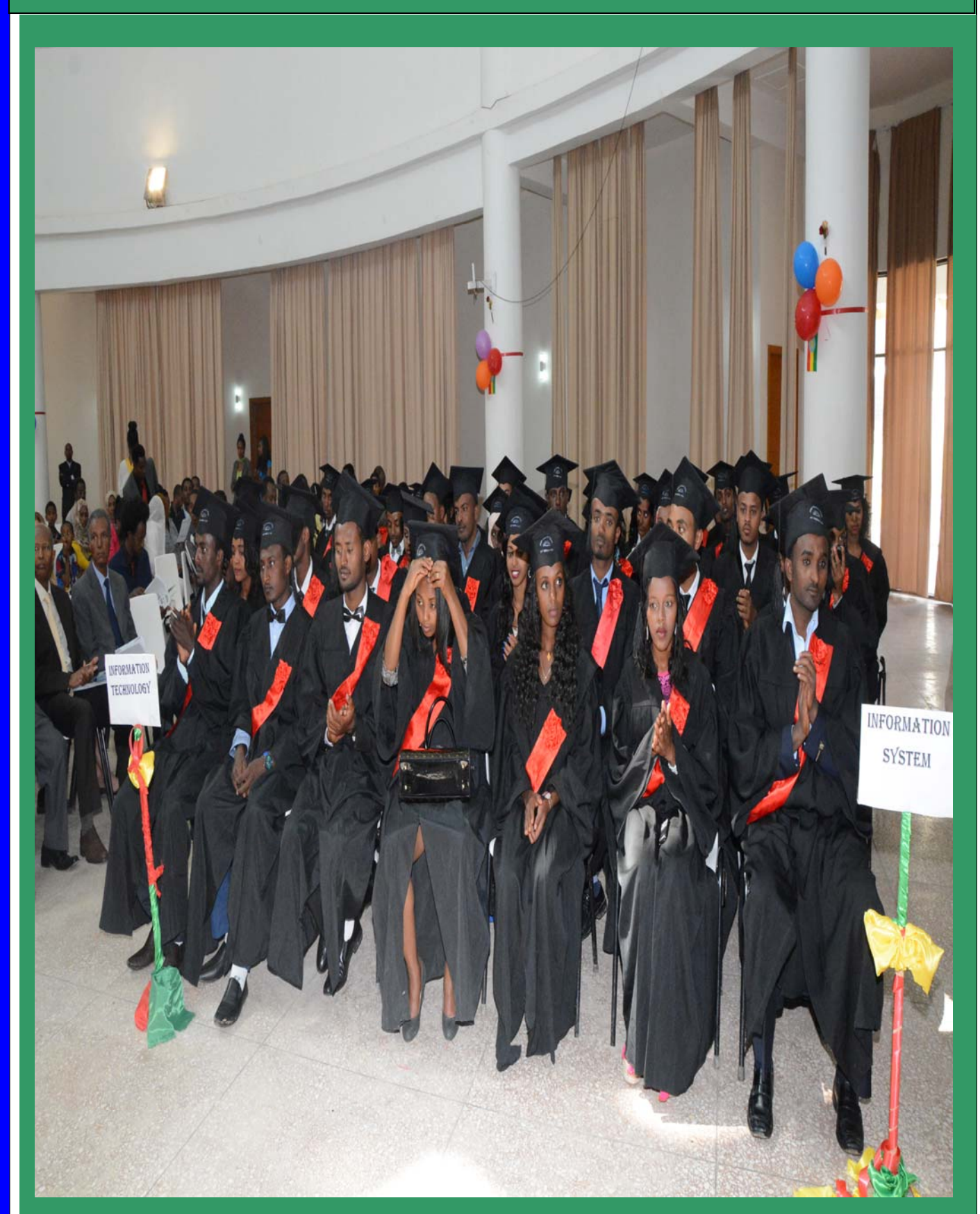
Partial View of Information Technology Faculty Graduates