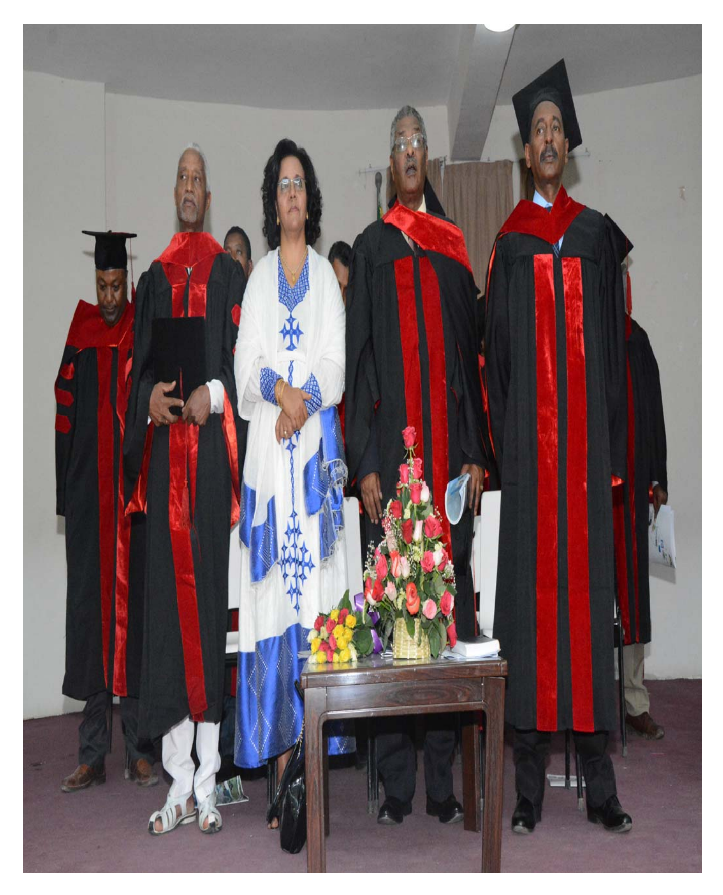
Pausing for National Anthem