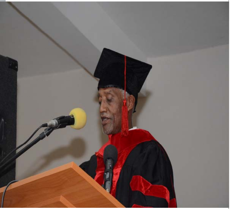
The President's welcome address

A welcome address was made by the President of the College. In his message to the audience, the President stressed on the importance of education in changing citizens lives for the better. The collaboration of many partners, both from abroad and from home has opened the door for many needy youth, including those graduating on this very day, it was stated. The College's un-