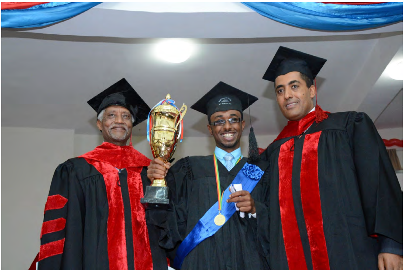
Trophy awarding to the top graduate