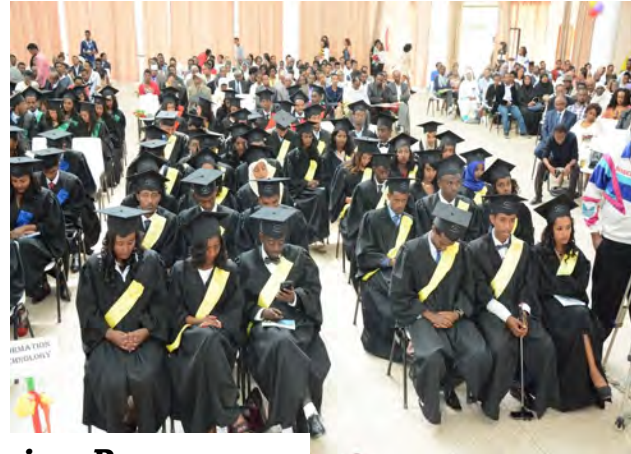
Audience during Prayer