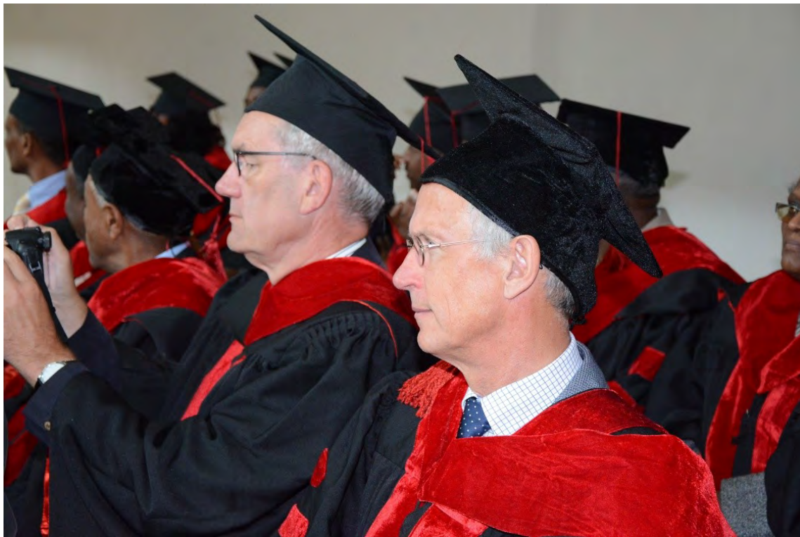
Partial View of Advisory Committee Members (WD)