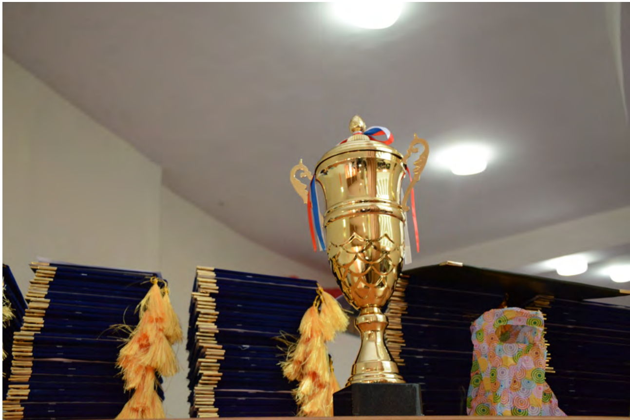
Trophies and Degree Folders