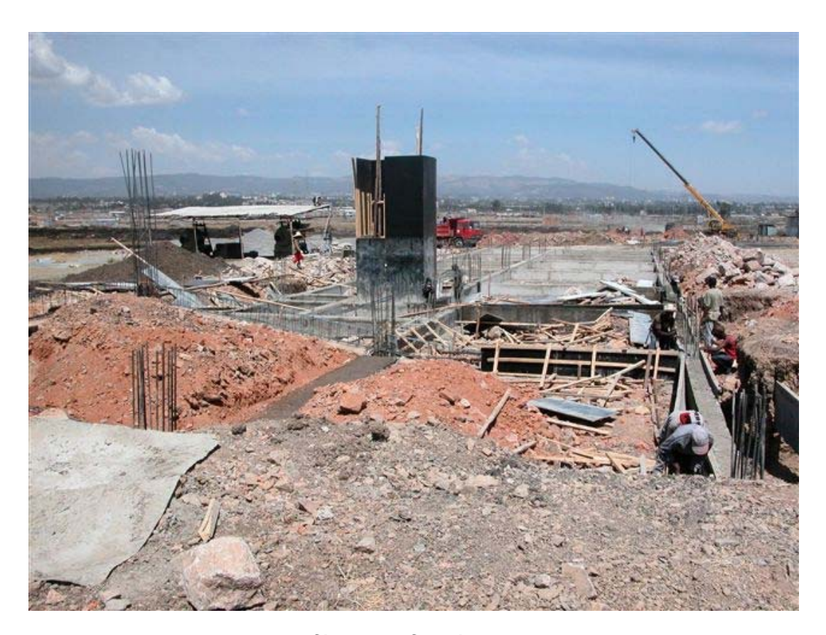
Classroom Complex 1

The progress to this building almost equals the service centre. The last foundation beams are being cast. In the foreground at the left the backfill for the slope of the lecture hall can be seen.