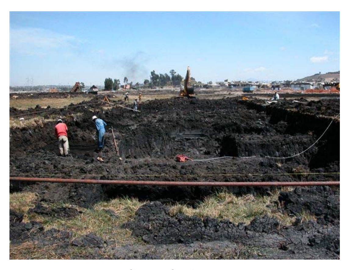
Classroom Complex 2

Excavation to the second classroom building had begun and will be finished in a couple of days after this picture was taken.