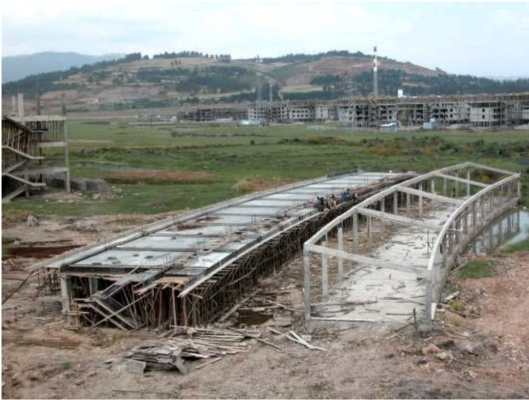
Staff Residence Building (H)

The concrete structure is in progress. Het betonskelet is in aanbouw.