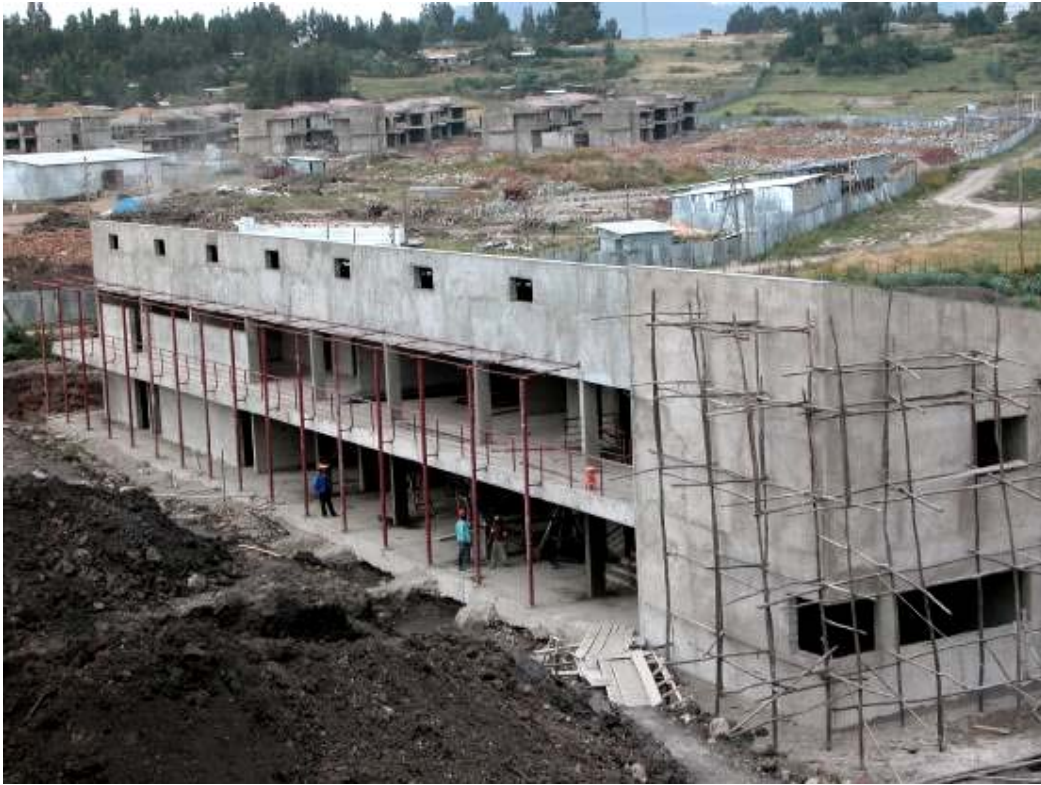
Administration Building (C)

The plasterwork to the inside and the outside of the building is finished. Het pleisterwerk aan binnen- en buitenzijde is gereed.