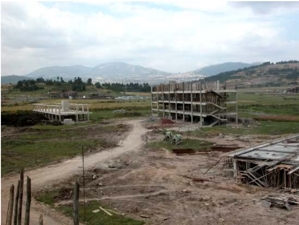
Faculty Office (E) & Classroom Building (F)

The plasterwork to the inside and the outside of the building is finished. Het pleisterwerk aan binnen- en buitenzijde is gereed.