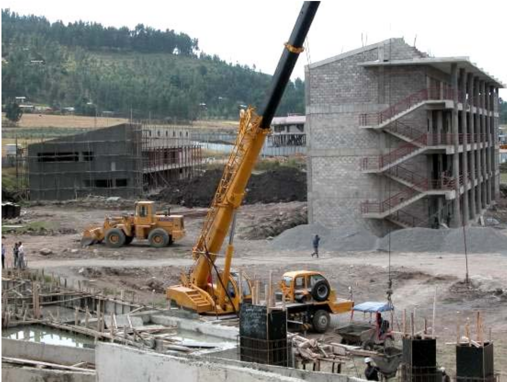
Service Centre (A) & Classroom Building (B)