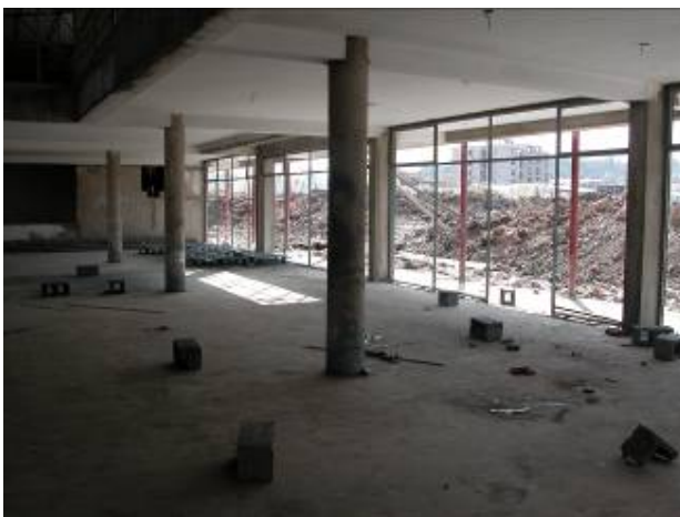
The students canteen in the Service Centre.