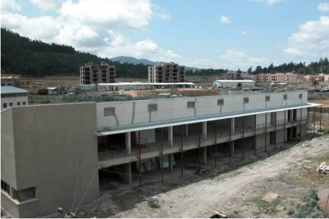
Faculty Office (E).