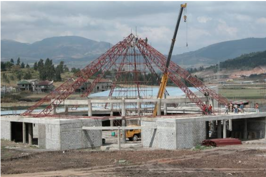
Multi-purpose Hall (D).