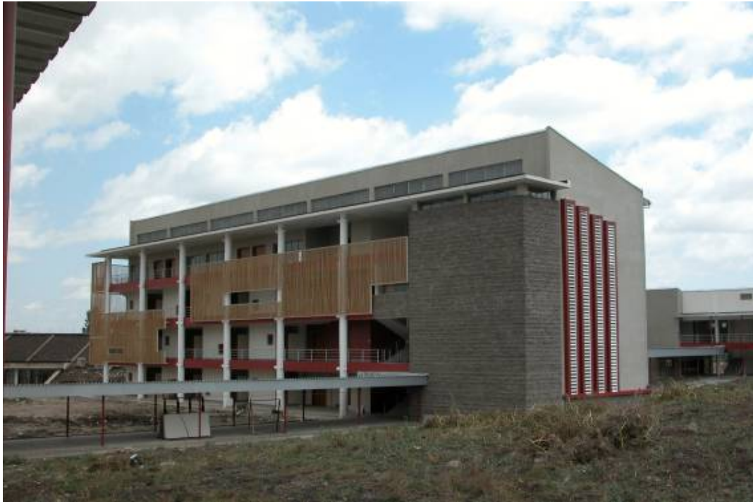
Classroom Building (B).