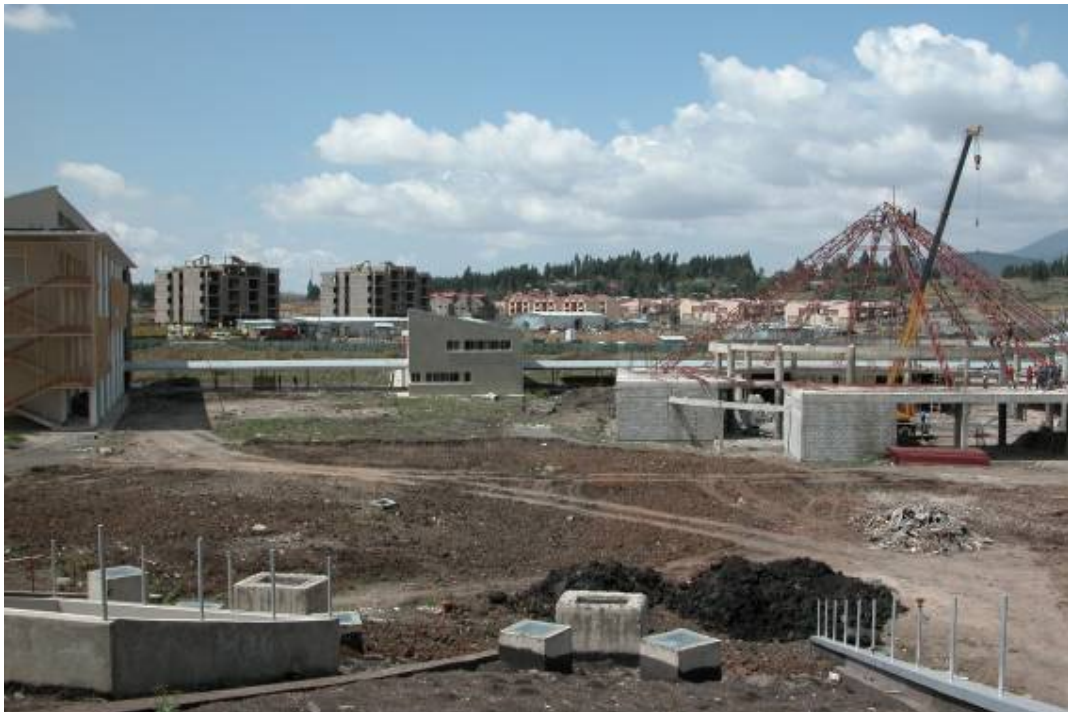
Classroom Building (B) at the left, Administration (C) in the middle, and Multi-purpose Hall (D) at the right.