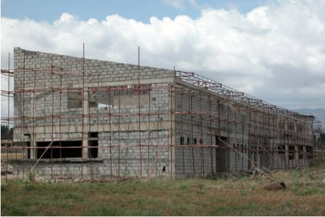
Sports & Technical Building (G).