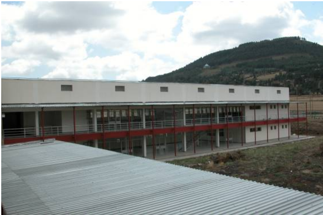
Service Centre (A).