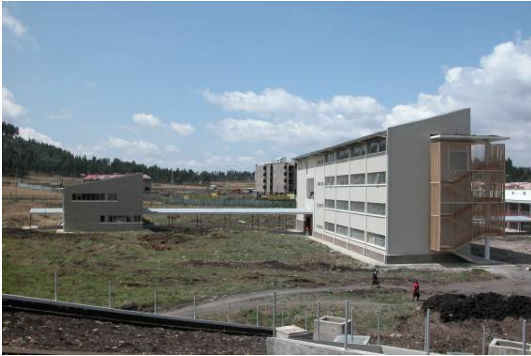
Service Centre (A) at the left and Classroom Building (B) at the right.