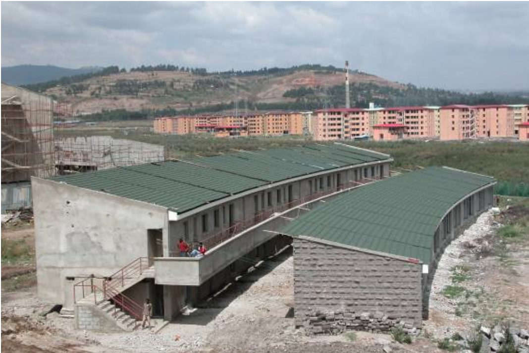
Staff Residence Building (H).