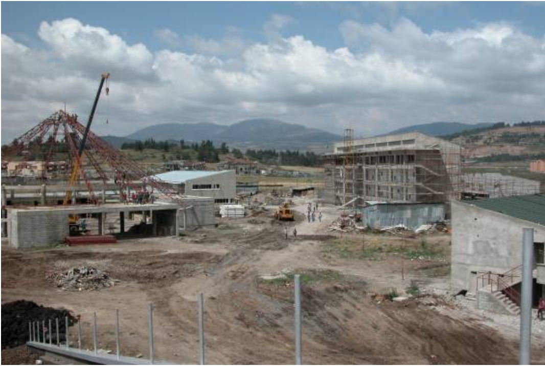
From left to right the Multi-purpose Hall (D), Faculty Office (E), Classroom Building (F), and a corner of the Staff Residence Building (H).