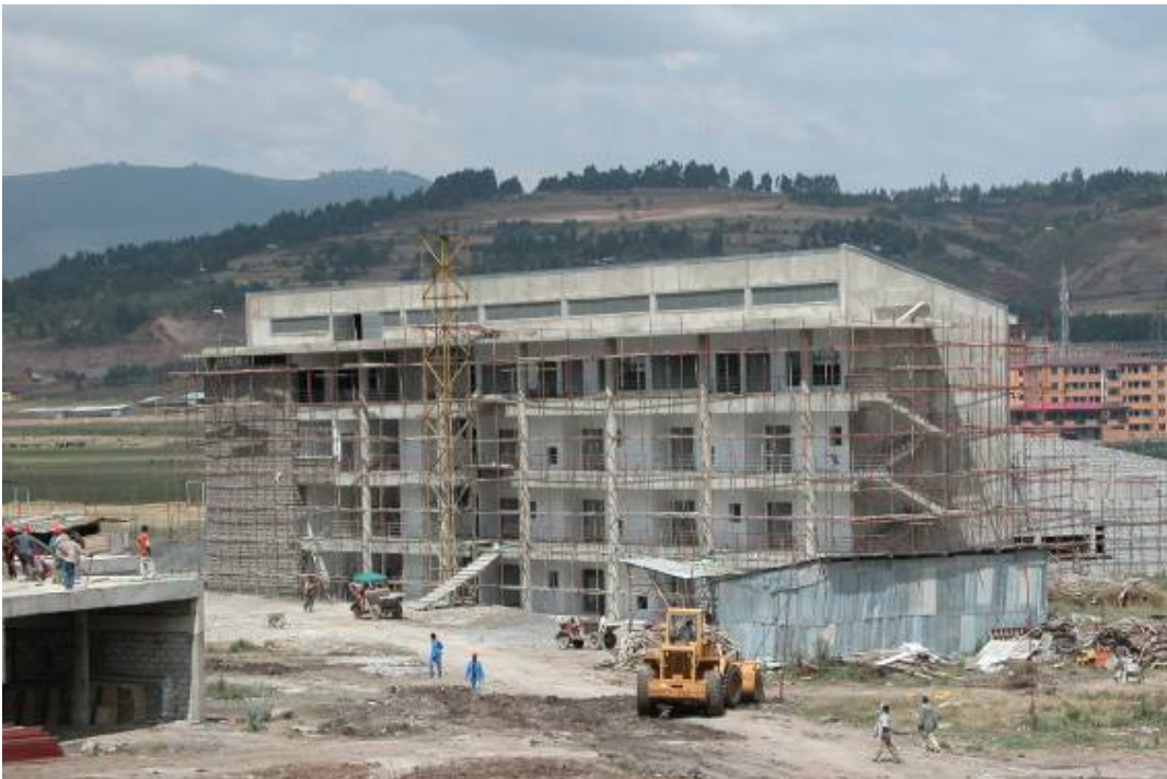
Classroom Building (F).