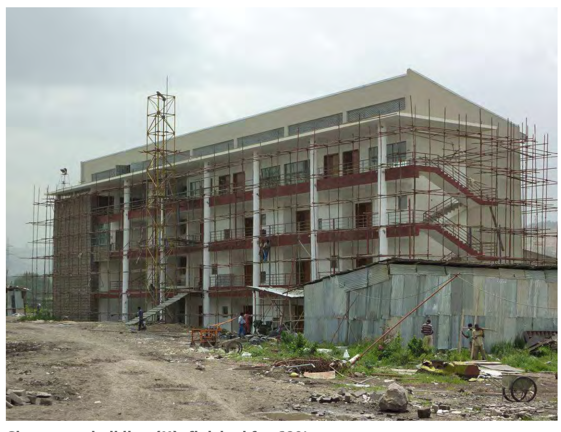
Class room building (H), finished for 60%.