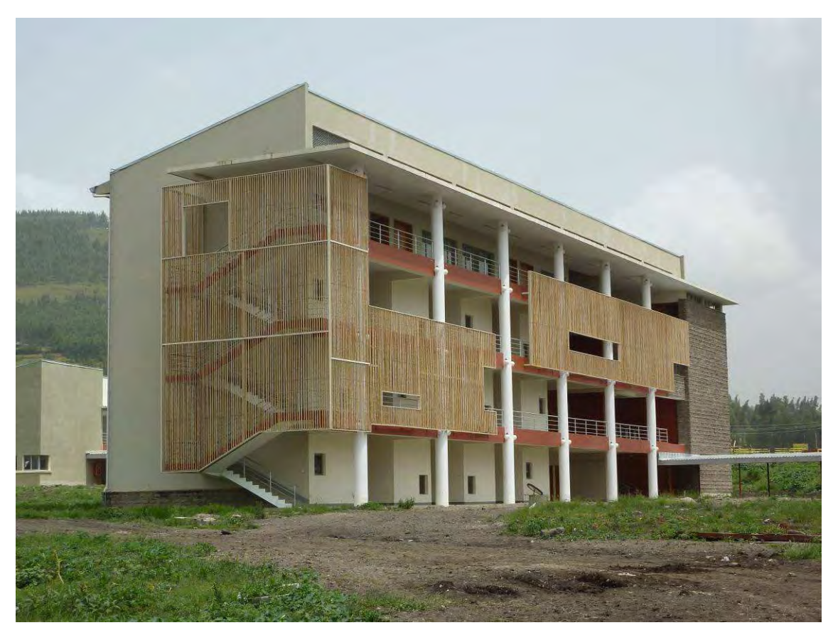
Classroom building (B), finished for 90%.