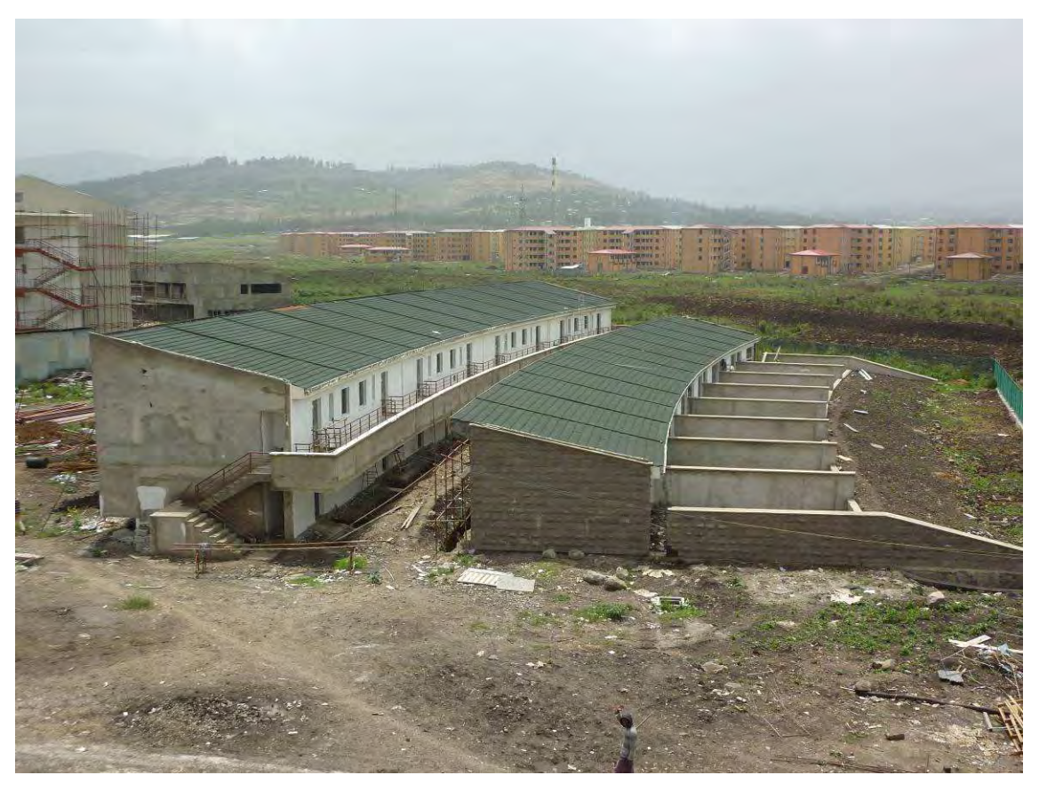
Staff residence (H), finished for 60%.