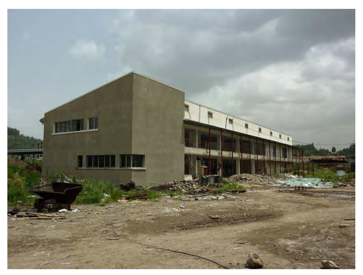
Faculty Office (E), finished for 60%.