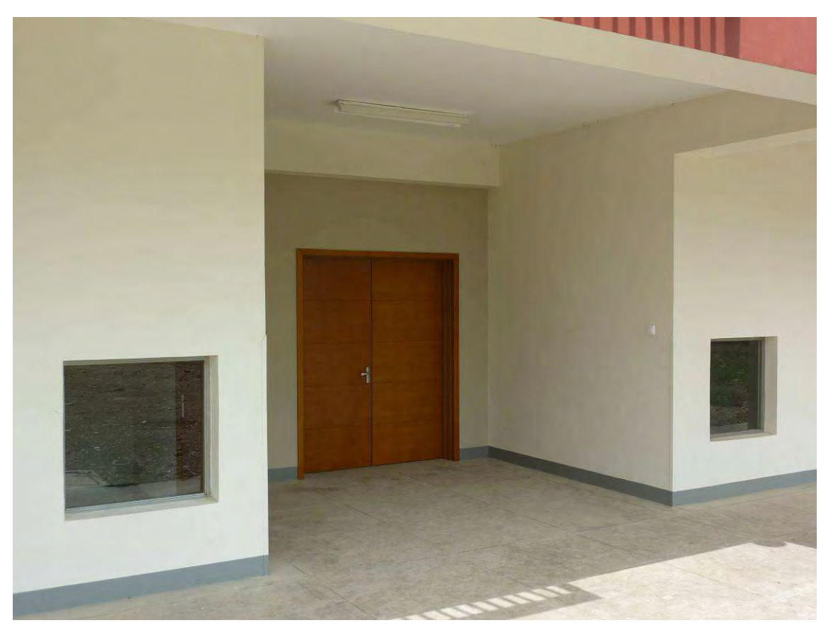
Fragment Classroom building (B), finished for 90%.