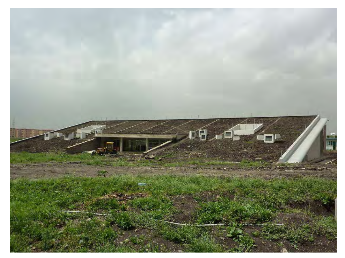
Library landscape roof (K), finished for 90%.