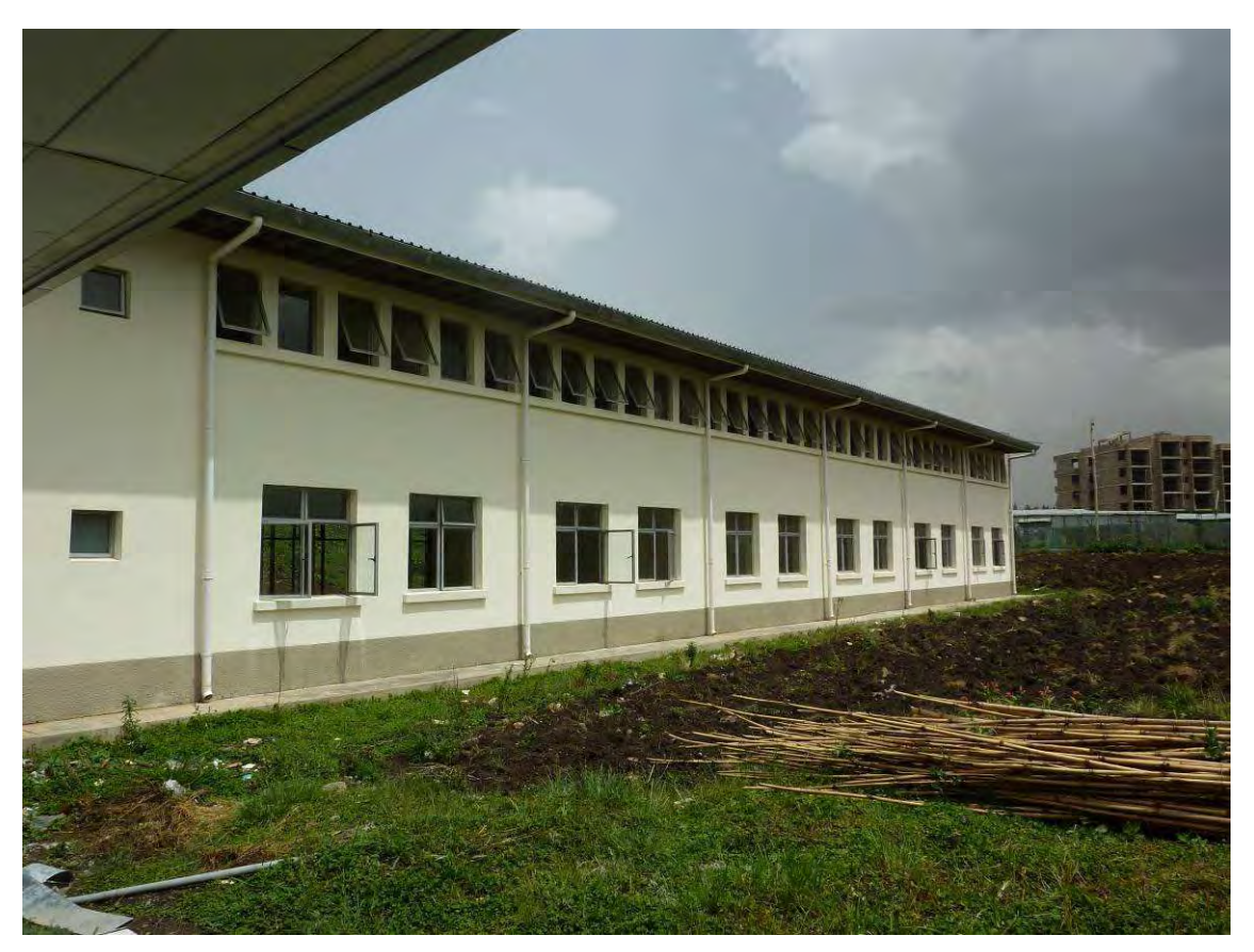
Management building (C), finished for 90%.