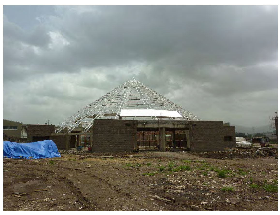
Multi purpose hall (D), finished for 40%.